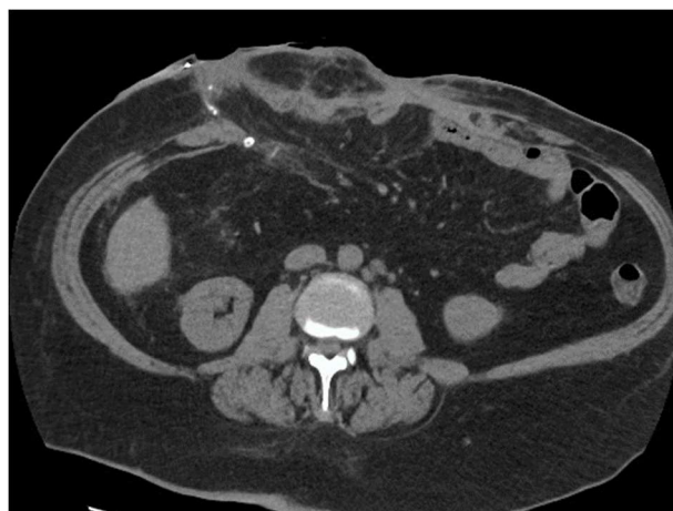
Figure 1: CT scan showing a large ventral hernia

A rise in inflammatory parameters was observed on the eighteenth postoperative day. A control CT scan showed a fluid collection near the transverse colon stump (Figure 1).