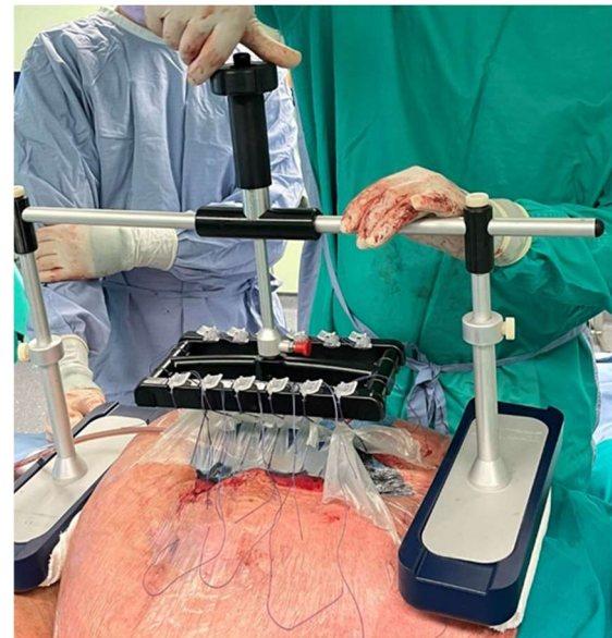
Figure 3: Installation of Fasciotens© Abdomen

dosage of diuretics was decreased the following day.